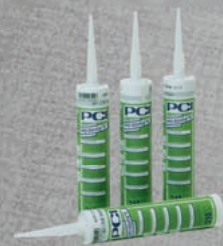
Elastic joint sealant PCI Silcofug® E for the interior and exterior

PCI Silcofug® E makes it a perfect combination. The elastic sealant exactly matches the PCI Nanofug® Premium colour range. PCI Carraferm® is the right choice for natural stones.