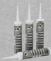
Silicone joint sealant PCI Carraferm® for natural stone